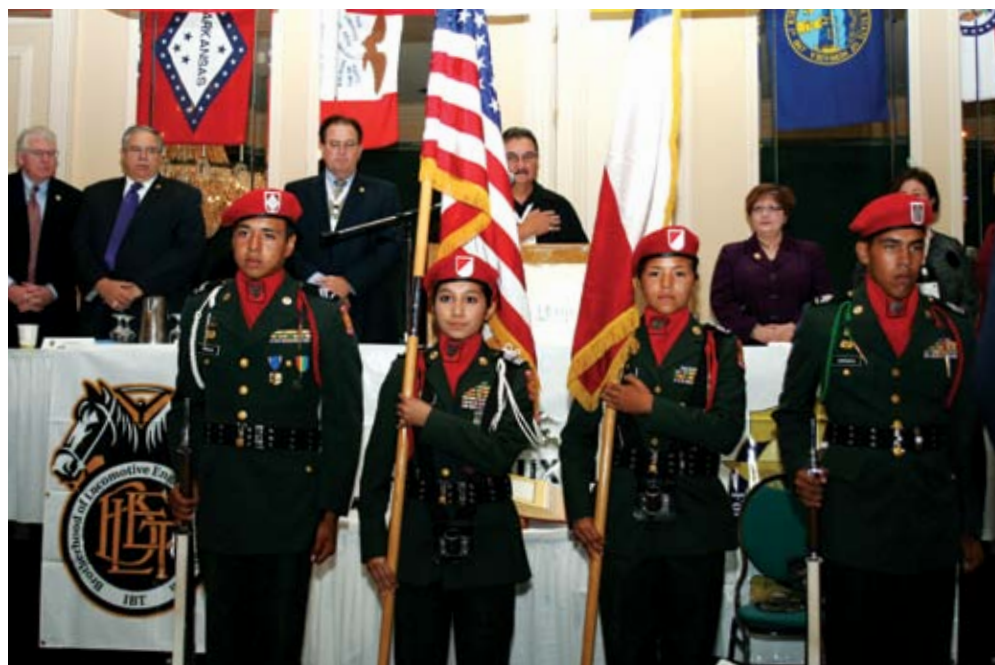
Color Guard: Presentation of the flags during opening ceremonies of the 76th annual SWCM in El Paso, Texas.