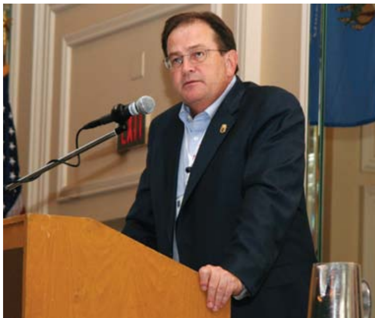
Strike Update: BLET National President Dennis Pierce discusses strike possibilities with BLET members during the Southwestern Convention Meeting (SWCM) in El Paso on September 20.

The Railway Labor Act (RLA) governs contract negotiations between the parties. The appointment of the PEB comes at the close of the mandatory 30-day cooling off period, a step in the RLA process that began on Sep-