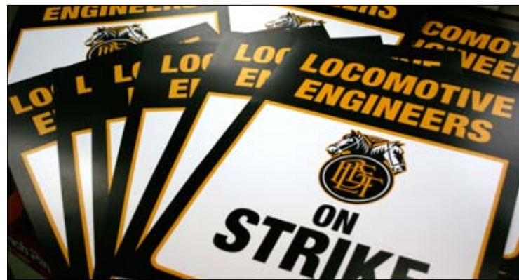
Strike Posters: The BLET National Division mailed thousands of picket signs to members during the last week of September.

There are many reasons we are at impasse with the Carriers, in this bargaining round, and I