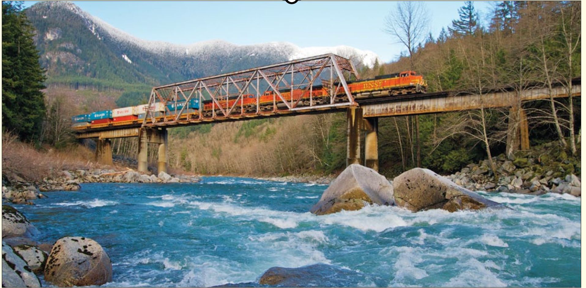
SKYKOMISH RIVER BRIDGE Approaching the long grade towards the summit of Steven's Pass, a BNSF Railway locomotive travels eastbound over the Great Northern Skykomish River Bridge near Gold Bar, Wash., on February 2, 2012.

PUBLISHED BY THE BLET, A DIVISION OF THE RAIL CONFERENCE, INTERNATIONAL BROTHERHOOD OF TEAMSTERS